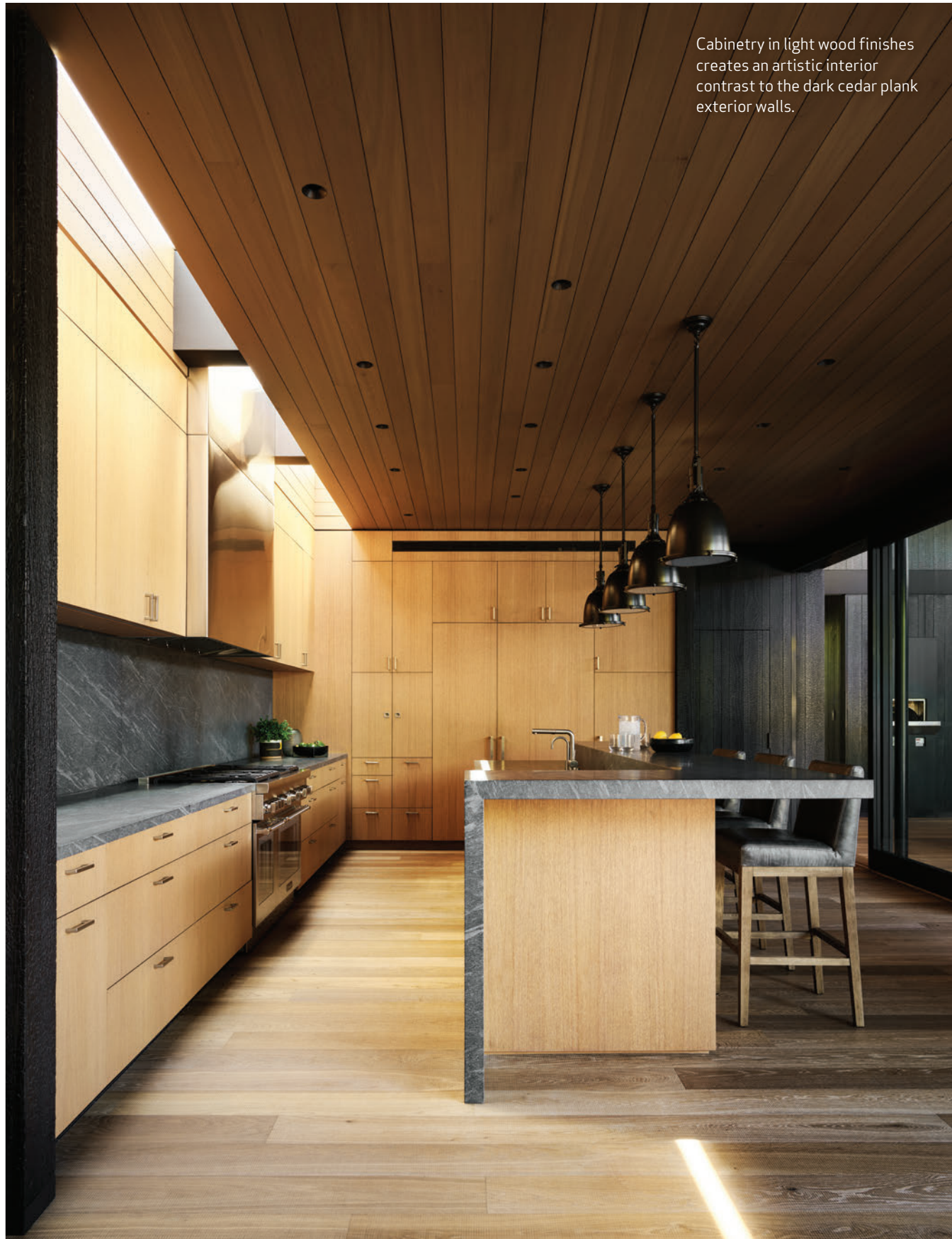
Cabinetry in light wood finishes creates an artistic interior contrast to the dark cedar plank exterior walls.