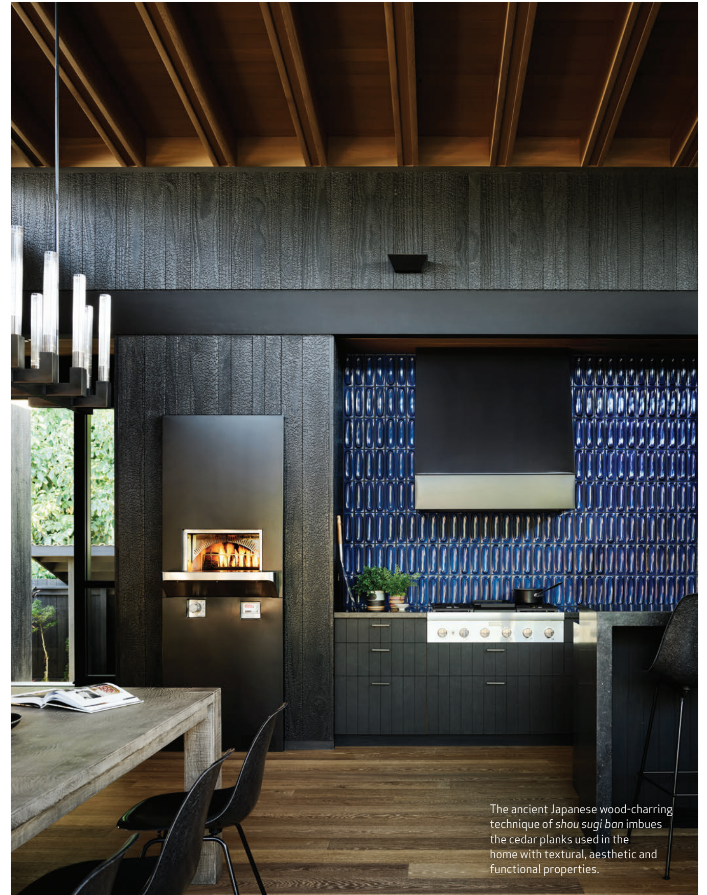
The ancient Japanese wood-charring technique of shou sugi ban imbues the cedar planks used in the home with textural, aesthetic and functional properties.