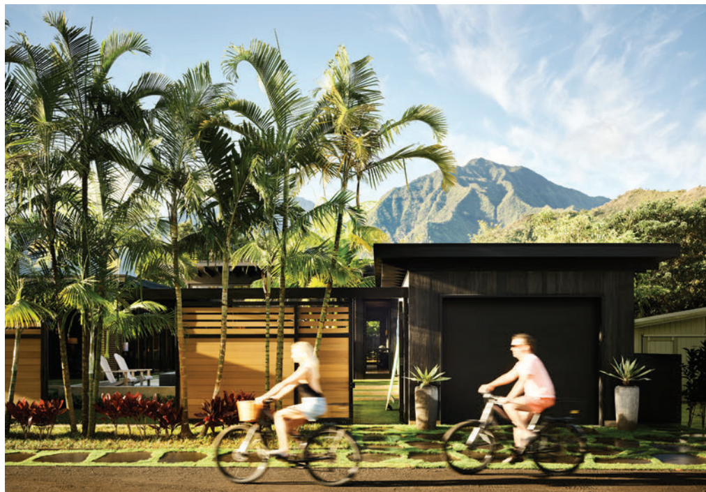
RIGHT: Wahi Lani was designed with the homeowners' active lifestyles in mind.