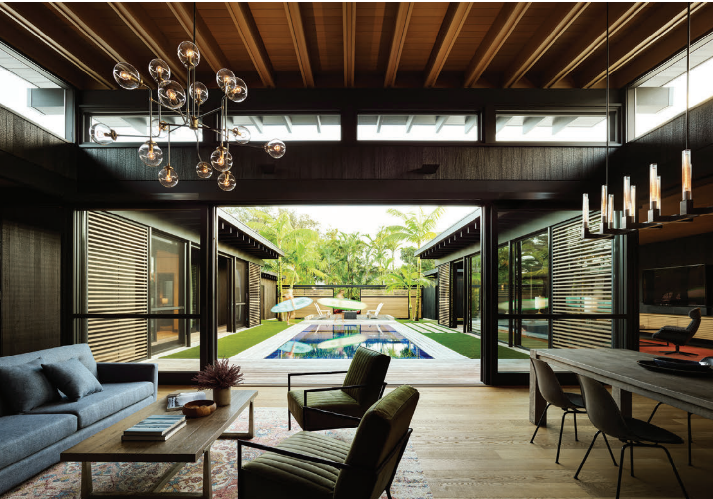
ABOVE: Luxe midcentury light fixtures introduce visually interesting shapes into the interior design.